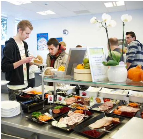
Breakfast & lunch can be bought in the Canteen