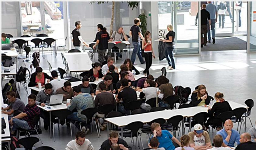
VIA University College