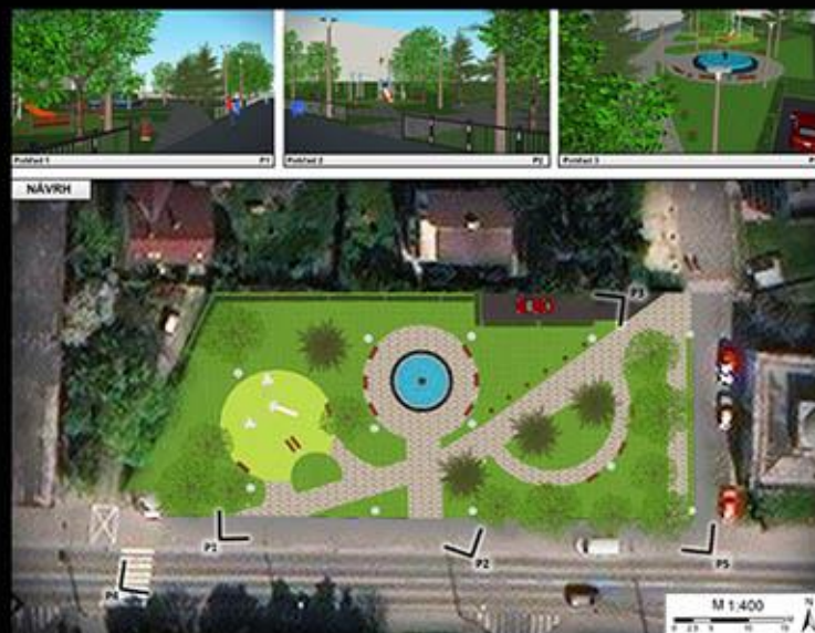
Mierová ulica Bratislava