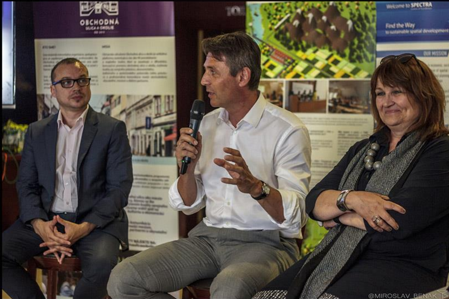
Diskusia s primátorom Bratislavy a hlavnou architektkou Bratislavy