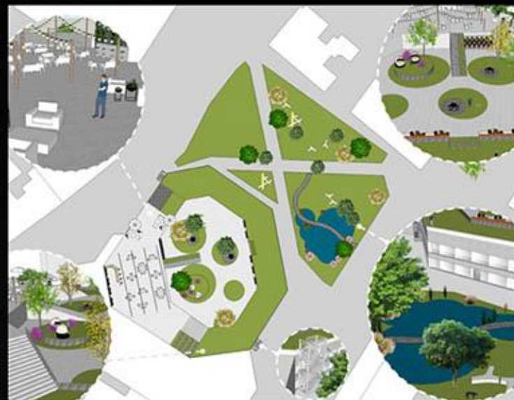
Posádkový klub Trenčín