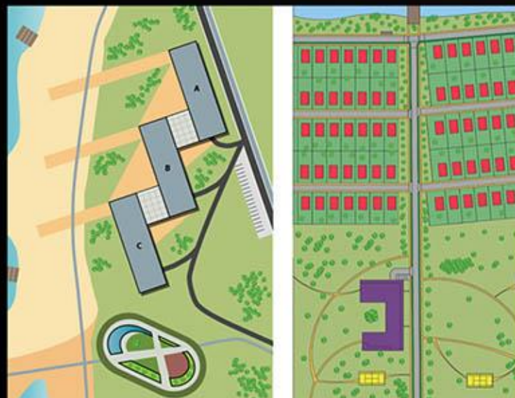
Zelená voda Bratislava